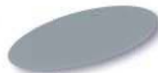
OLD TOWN GRAY